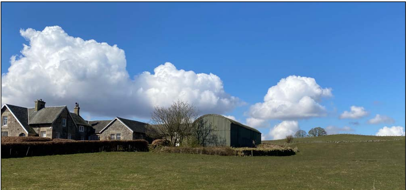
View from Stepends Road

As planning permission has already been granted for the forge and associated ancillary accommodation and as these planning permissions remains extant, the principle of the use at this Green Belt location with reference to Policy 14 of the adopted Local Development Plan and Policy 15 of the proposed Local Development Plan may not be revisited in determining this application. It therefore rests to consider the amendments to the original planning permission with reference to both the above policies together with Policy 1 of the adopted and proposed Plans. In this respect Policy 1 of both Plans requires all development to have regard to the six qualities of successful places. The relevant factors in respect of this development contributing to the qualities of successful places are being "Distinctive" in reflecting local architecture and urban form together with being "Adaptable" and "Resource Efficient" in making use of and adapting existing buildings for a new use. Policy 14 of the adopted Plan and Policy 15 of the proposed Plan advise that development in the Green Belt and Countryside will only be permitted if it is appropriately designed, located, and landscaped, and is associated with one of five criteria. Criterion (e) of both Plans relates to the intensification of an existing use of an appropriate scale and form within the same curtilage. Policy 15 of the proposed Plan additionally permits development in exceptional or mitigating circumstances.